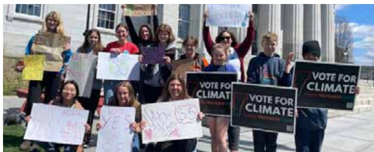
Students from Montpelier and Burlington outside of the Vermont State House advocating in support of the Affordable Heat Act.