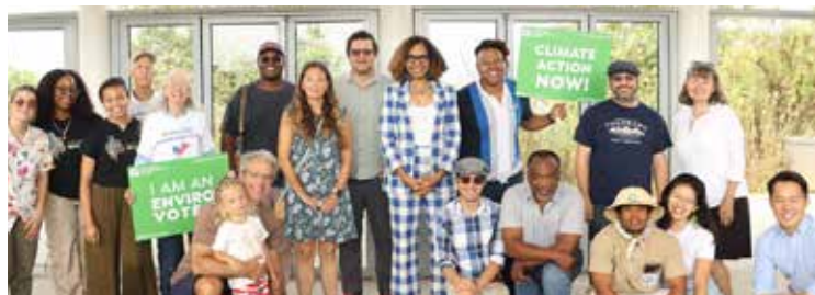
U.S. Representative Sydney Kamlager-Dove and California Environmental Voters holding a climate roundtable with activists in Los Angeles County.