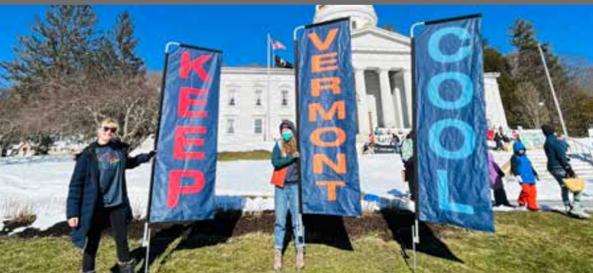
Activists calling on the Vermont Legislature to pass the Affordable Heat Act.

At the end of 2022, Vermont became the first state to adopt California's Advanced Clean Cars II rule, requiring 100% of new car sales to be zero-emission vehicles by 2035, and adopted the Advanced Clean Trucks standards to increase sales of electric medium- and heavy-duty vehicles. In 2023, the state extended a transportation and heating electrification pilot program and added a provision allowing the Burlington municipal electric utility to set up incentives for city residents who use the most gasoline to transition to electric vehicles. This is the first legislative action in the country specifically addressing gasoline "superusers."