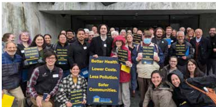
Oregon Building Resilience coalition advocating for the climate package.

– Representative Khanh Pham, Oregon State Legislature