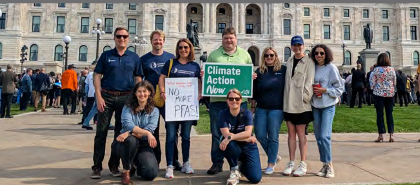
Conservation Minnesota staff advocating for 100% clean energy at the state Capitol.

Minnesota passed a historic $2 billion climate budget that established the strongest protections against "forever chemicals" in the country, addressed environmental justice concerns, and included bold decarbonization initiatives. The bill also established a green bank to finance green energy projects, and allocated funding for protecting and restoring natural resources and ecosystems.