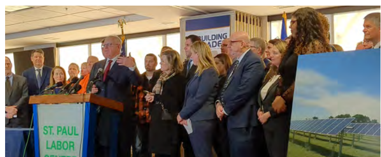
Minnesota Governor Tim Walz and legislative champions at the signing of the 100% Clean Energy bill.