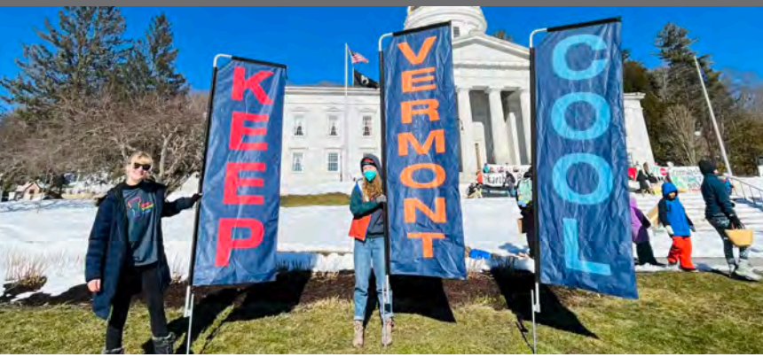
Activists calling on the Vermont Legislature to pass the Affordable Heat Act.

At the end of 2022, Vermont became the first state to adopt California's Advanced Clean Cars II rule, requiring 100% of new car sales to be zero-emission vehicles by 2035, and adopted the Advanced Clean Trucks standards to increase sales of electric medium- and heavy-duty vehicles. In 2023, the state extended a transportation and heating electrification pilot program and added a provision allowing the Burlington municipal electric utility to set up incentives for city residents who use the most gasoline to transition to electric vehicles. This is the first legislative action in the country specifically addressing gasoline "superusers."