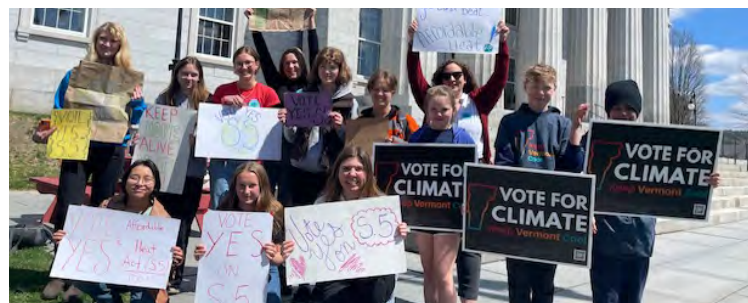
Students from Montpelier and Burlington outside of the Vermont State House advocating in support of the Affordable Heat Act.