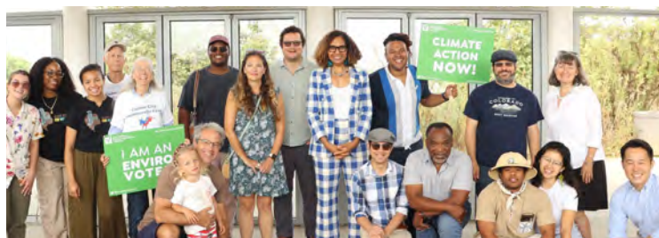
U.S. Representative Sydney Kamlager-Dove and California Environmental Voters holding a climate roundtable with activists in Los Angeles County.

– Speaker Robert Rivas, California State Assembly