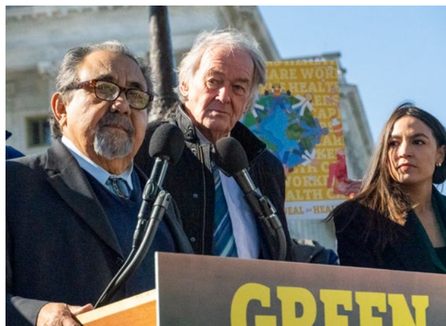
Rep. Grijalva at a press conference for climate action with Sen. Markey and Rep. Ocasio-Cortez .

Ranking Member Grijalva also continued to lead opposition to schemes undermining the National Environmental Policy Act (NEPA), the Endangered Species Act (ESA), and other bedrock environmental laws, including the Fix Our Forests Act and Energy Permitting Reform Act. The NEPA process ensures that communities know about environmental and health impacts from potential projects and can