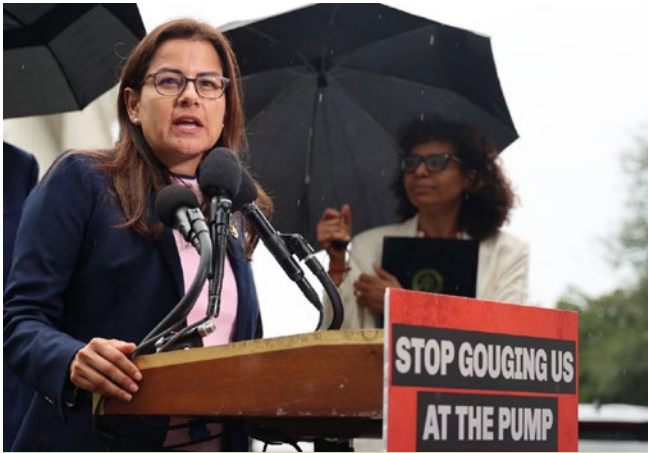
Rep. Barragán at a press conference calling out polluter price gouging and the need for accountability for big oil and gas corporations with Rep. Kamlager-Dove .

Members of Congress also publicly pressed for polluter accountability with news conferences, including Representatives Barragán, Kamlager-Dove, Joe Neguse (CO-02), and Ilhan Omar (MN-05) .