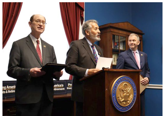
Rep. Vargas uplifts the SEC climate rule at a press conference with Reps. Sherman and Casten.