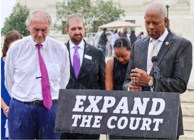
Rep. Johnson at a press conference in the pouring rain calling for the expansion of the Supreme Court along with Sen. Markey.