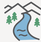
PUBLIC LANDS AND WATERS